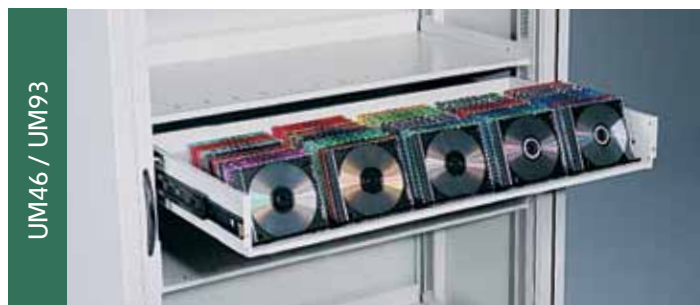
UM46 / UM93

Each kit can be configured to create up to 24 separate compartments offering 5½"W x 4"D x 3½"H storage in each section.