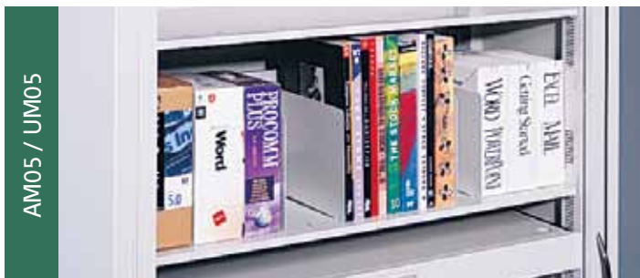
AM05 / UM05

This shelf contains ten divided slots to store different types of collateral or classroom handouts.