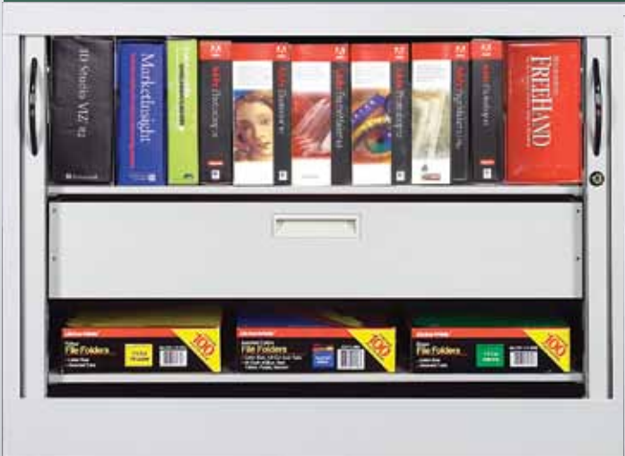
30" Sidewinder Tambour Cabinet