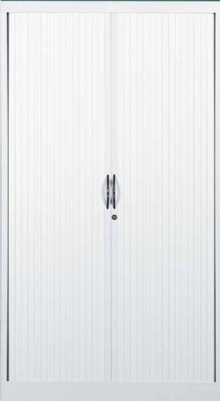
72" Sidewinder Tambour Cabinet