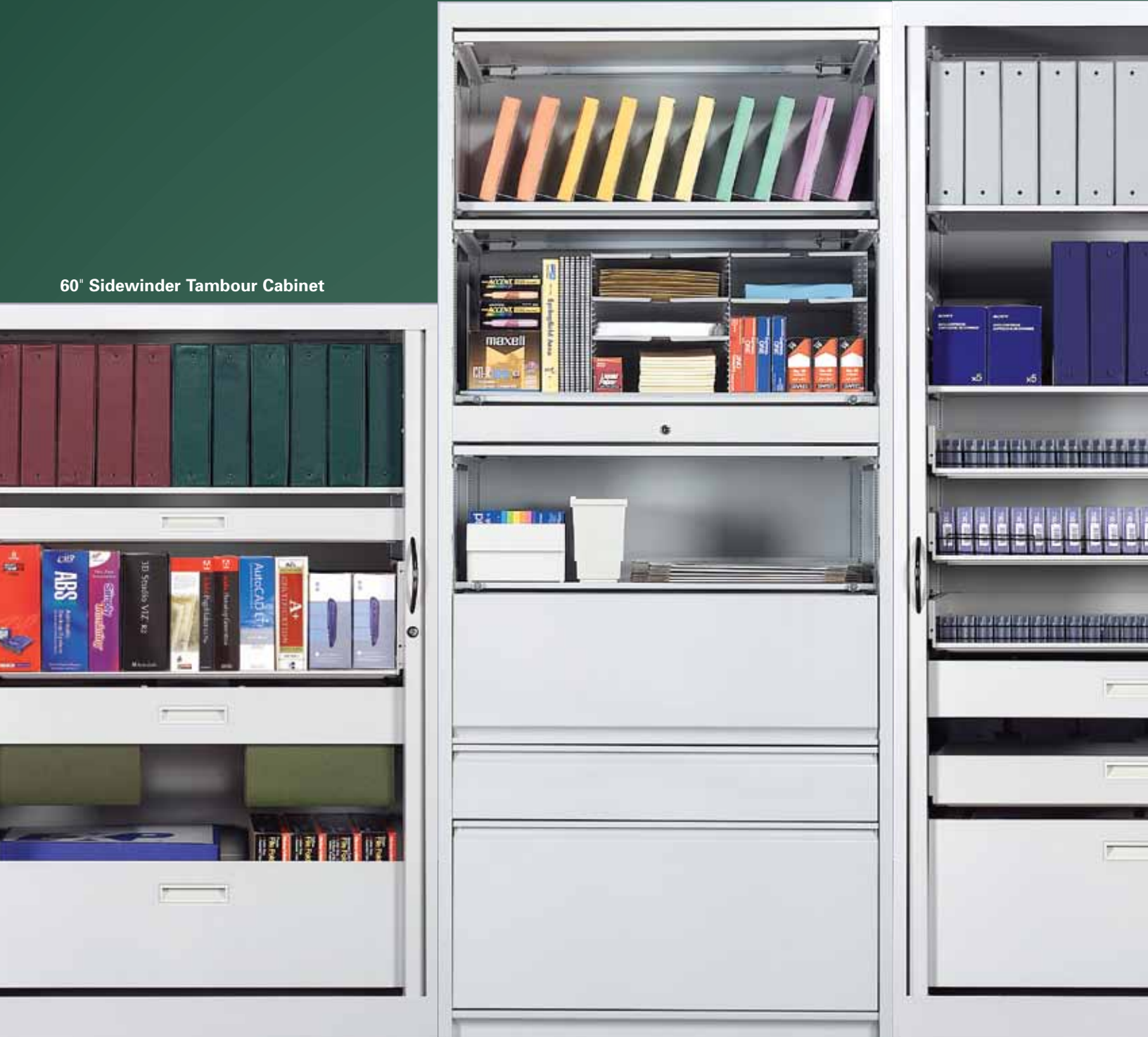
60" Sidewinder Tambour Cabinet