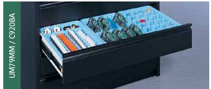
UM79MM / C920BA

Printed Circuit Boards (PCBs) and Network Interface Cards (NICs) are stored safely and accessed easily on roll-out shelves or drawers with integrated holders.