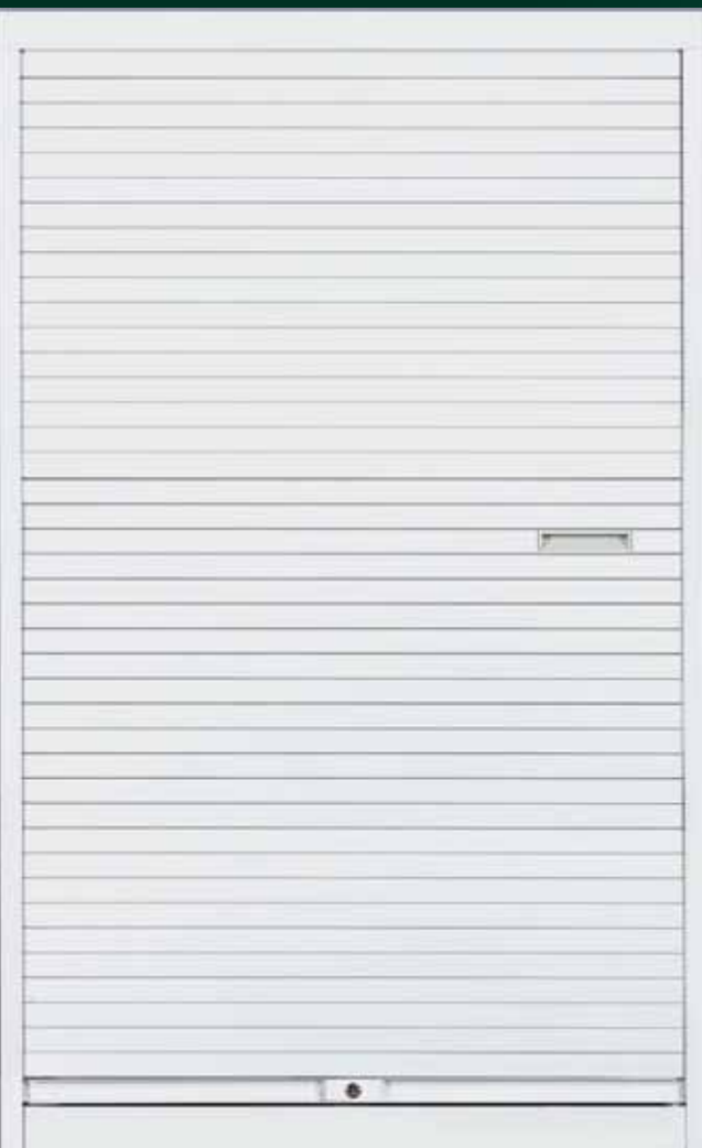
60" Sidewinder Tambour Cabinet