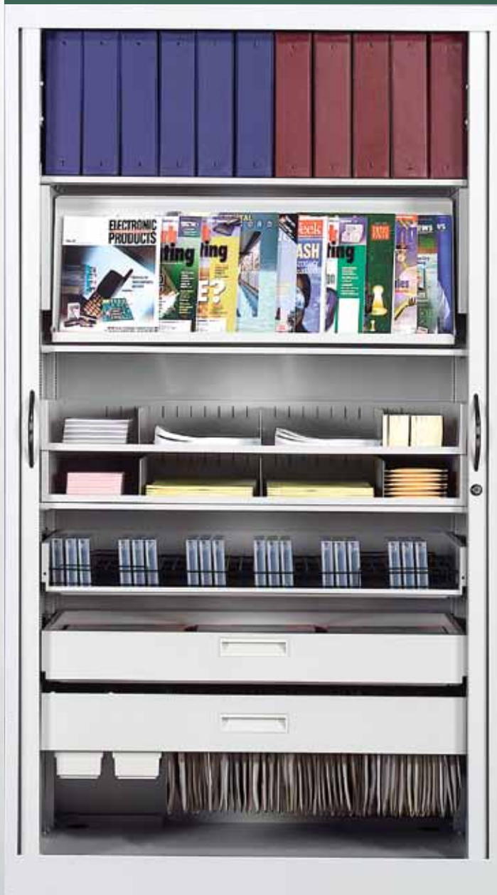
72" Sidewinder Tambour Cabinet