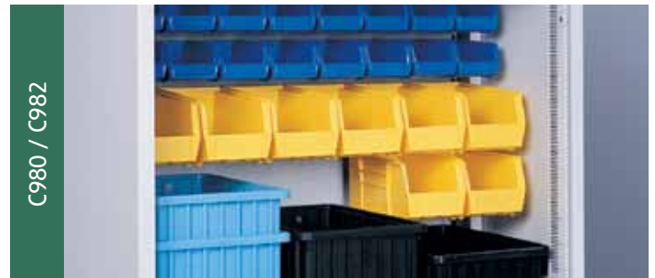
C980 / C982

Optimedia cabinets offer static-free storage. A 10' (12 gauge) green wire, attaches to the bottom corner or underside of the cabinet and connects to a grounding source.