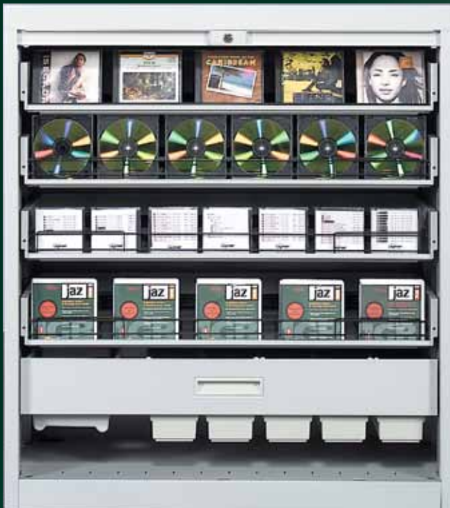
42" Classic Tambour Cabinet