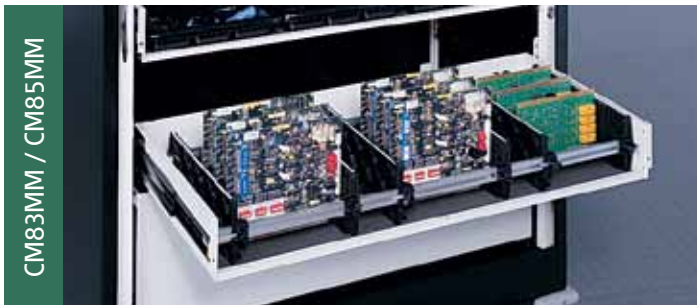
CM83MM / CM85MM

This rack system for tapes offers high-density storage of DLTs, DEC TK50, TK70 or 3M Compaq™ tapes on a 4" roll-out shelf. This wire rack holds 66 tapes.