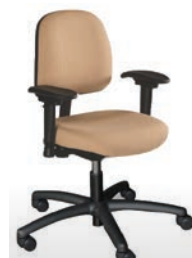
CR Fusion Part# SCRG0100