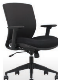
NG VXO Part# SNGG0100