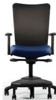
NP U3ia Stool Part# SNPL301