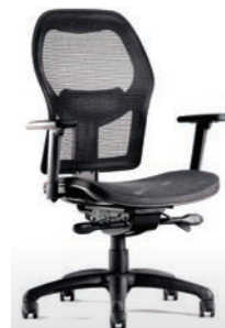
NP Right Chair Part# SNPG0201