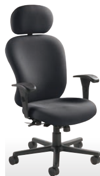
NG Heavy Duty Part# SNG24300

Eaton offers a full line of ergonomic and contemporary seating, perfect for the office environment. From executive and task seating solutions to guest and conference seating, the wide range of designs and options integrate seamlessly in your workspace.