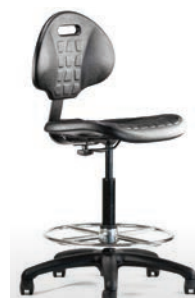
NP Geo Stool Part# SNPL100